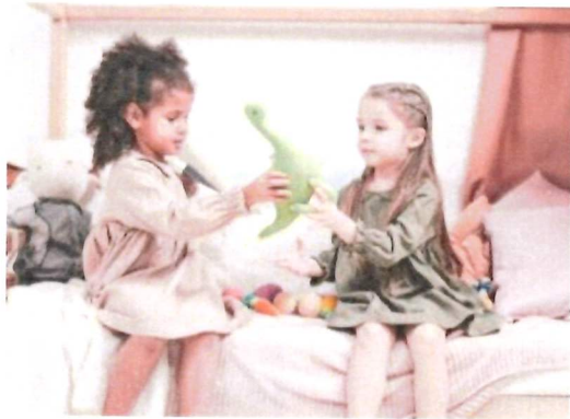
Sharing my toys

INTERACTIVE TIME: Now it's over to you... use these visual cards to help your child to understand what makes a good friend with these visual cards. There is also a blank card for them to put their own ideas about what makes a good friend. You can cut these out and use again and again.