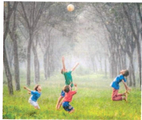
Asking a friend to join your game