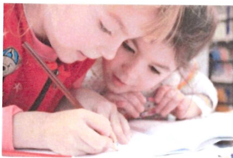
Helping a friend who is stuck with their work